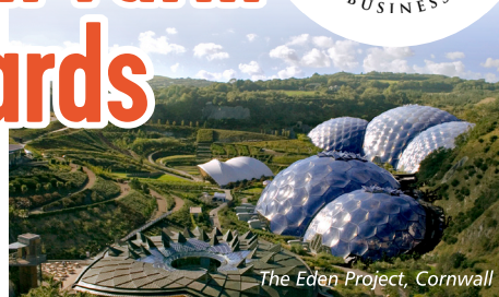
The Eden Project, Cornwall

BUY YOURS TODAY TO AVOID DISAPPOINTMENT AND THANK YOU FOR SUPPORTING THE ADDINGTON FUND!