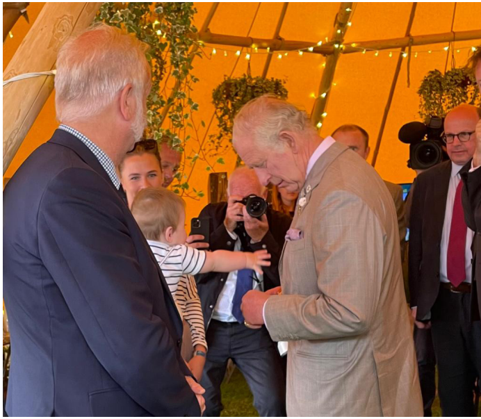
HRH The Prince of Wales on the Duchy of Cornwall stand