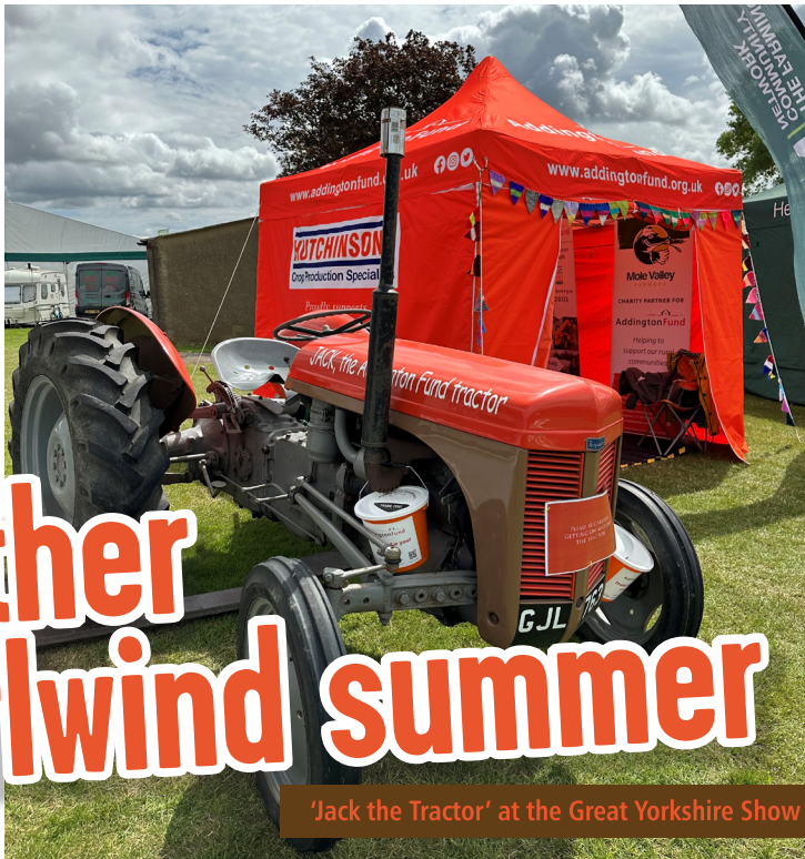
'Jack the Tractor' at the Great Yorkshire Show

Our orange gazebo has done another tour of the UK this summer, visiting national and regional shows. Here's a quick round up of what we've been up to.