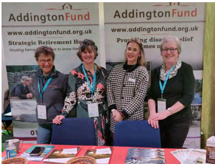
The Addington Fund Team at the NFU Conference Dinner stand