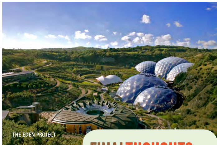
THE EDEN PROJECT

Last year, our Cornwall Farm Business Awards were moved from March to the end of September because of ongoing covid restrictions. Given the positive feedback, we have decided as we move forward to keep the Awards in September.